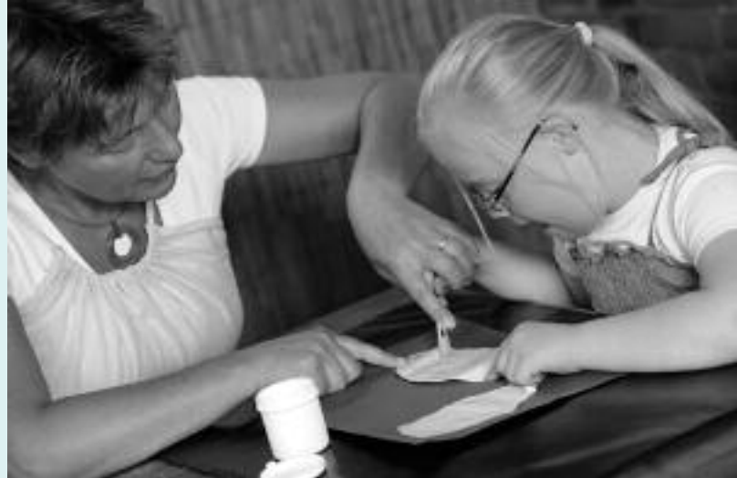
CHART, in Tucson, provides resources to families with adopted children.

Camp of Dreams provides 230 students from the Chicago area with year-round free education and cultural enrichment opportunities. The IECA Foundation provided two previous grants to Camp of Dreams: $7,500 in 2007 for staff training and $5,000 in 2008 for the Community Days program. This grant supports an annual college tour for their oldest campers. These tours introduce students to the expectations and rigors of university education, demystify the college admission process, and encourage and increase college attendance. Inner city students visit five colleges in Indiana and Ohio during the summer. The Foundation board awarded Camp of Dreams $5,000.