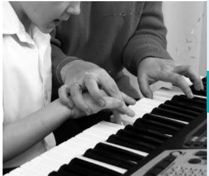
KEYS believes that music instruction helps kids with goal planning, achievement, and maturity. The program is located in Bridgeport, Connecticut.