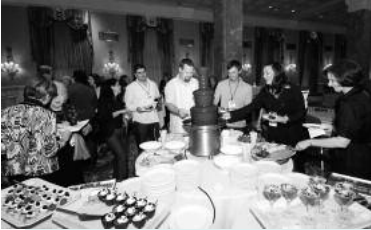
Prior to the show, IECA Foundation sponsors and guests enjoyed a chocolate fountain and a champagne toast.