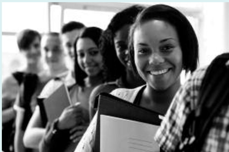
Disadvantaged students from Philadelphia are assisted through mentoring provided by Summer Search.

Wilson is a public school in Charlotte, North Carolina, and part of the Charlotte-Mecklenburg Schools. Wilson Middle School serves approximately 543 students in grades 6 through 8. Foundation monies are used to provide group piano/music production classes to approximately 120 students. These classes will be linked to math and science curriculums and used as means of improving student academic and behavioral outcomes. The math lessons emphasize computational skills and the use of proportions by teaching about meter, timing, and authoring music. Similarly, science lessons on electricity and technology are tied to music production. These lessons help students stay engaged in the school by exposing them to interests and careers in the arts. The Foundation award to Wilson Middle School was for $4,000.