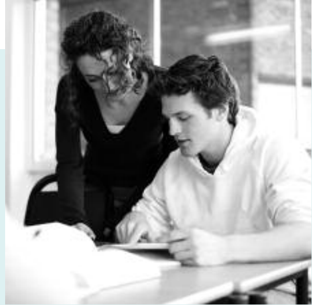
Kid Zone, a program of North Light Community Center, is designed to increase the literacy rate of Philadelphia students.

Summer Search has an outstanding record of giving low income students the opportunities and support necessary to achieve their potential, and become role models and everyday leaders. The Philadelphia office opened in 2006 and now serves almost 100 students from the Philadelphia public school system. The Foundation awarded $3,000 for their high school mentoring program. This highly individualized program is designed to help students function, navigate and ultimately maximize the benefits and skill sets gained in their summer and college access programs.